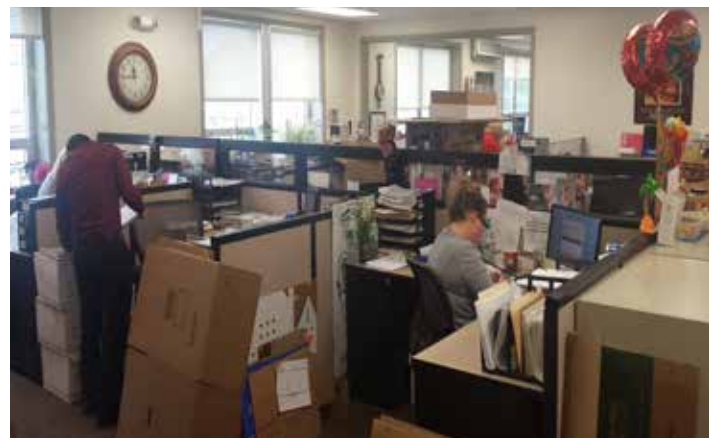
Customer Service Team at work